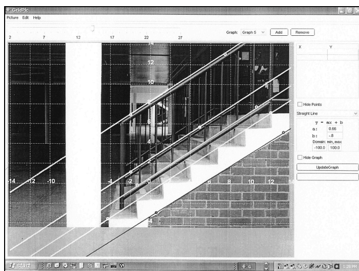
Figure 1. A stairway with rails imported into GridPic with several linear functions displayed.

integrated into the teaching practice at this school. The application goes “beyond the blackbox approaches of finding coordinates and the regression equations” (TB1). After selecting a picture (e.g., a stairway with rails, see Figure 1), GridPic allows the user to click on any point on the image. The coordinates, with reference to an overlaid Cartesian axes system, are automatically listed in a table of values. To find a model of the set of points the user selects from ten options including straight line, quadratic, and vertical line. A general algebraic equation for the selected model appears. The selection of straight line gives y = ax + b and allows the user to enter values for either or both of a and b and then select “show line”. Using guess, check, and refine the user can determine a function that best fits the points. In addition, the picture can be hidden by the user to produce a view similar to a graphing calculator screen. The use of GridPic “had a profound effect on the way in which the topic was presented” and “raised the importance of the visual and tabular information as aids to understanding the concepts of the algebraic representation” (TB1).